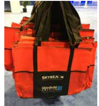
Sponsor responsible for producing bags and shipping to show site.