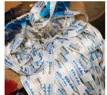
Sponsor responsible for producing lanyards and shipping to show site.